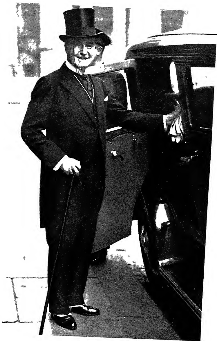
LEAVING FOR BUCKINGHAM PALACE TO BE KNIGHTED